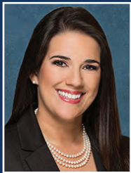
Sen. Anitere Flores