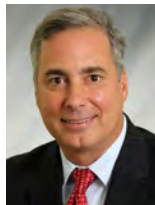
Second Vice President Hon. Joseph Corradino Mayor, Village of Pinecrest