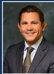
Sen. Jason W.B. Pizzo