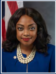
Rep. Dotie Joseph