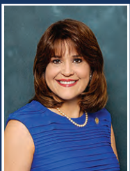
Sen. Annette Taddeo